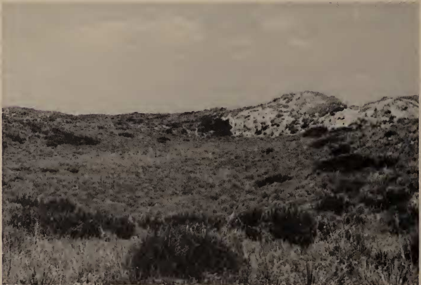
FIG. 9.—Intergrading communities of sand sage, Havard shin oak, and grasses west of Muleshoe, Bailey County.